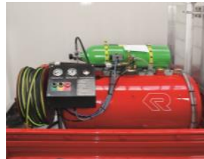
In emergency vehicle