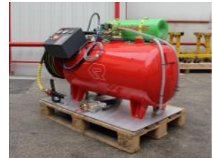
In mobile use